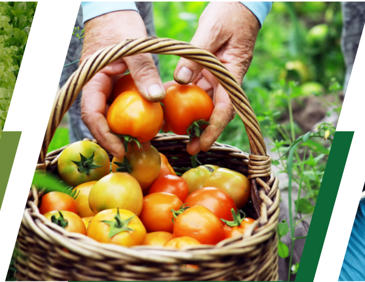
BEST BAHRAINI FARMER