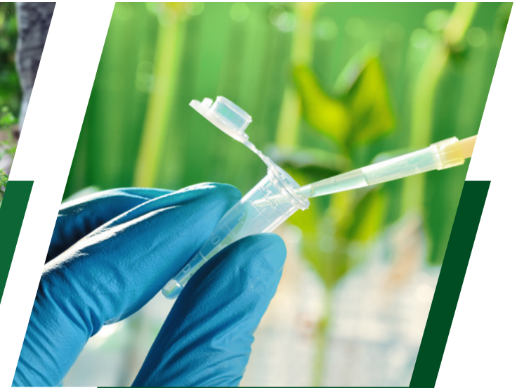
BEST AGRICULTURAL RESEARCH AND STUDIES