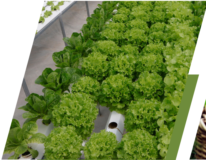
BEST AGRICULTURAL PROJECT

King Hamad Prize for Agricultural Development is divided into three categories: